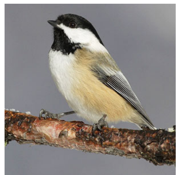
Figure 5: A Black-capped Chickadee, Poecile atricapillus

As greenhouse gases alter plant chemistry, these birds may become more selective in choosing which caterpillars to feed upon.